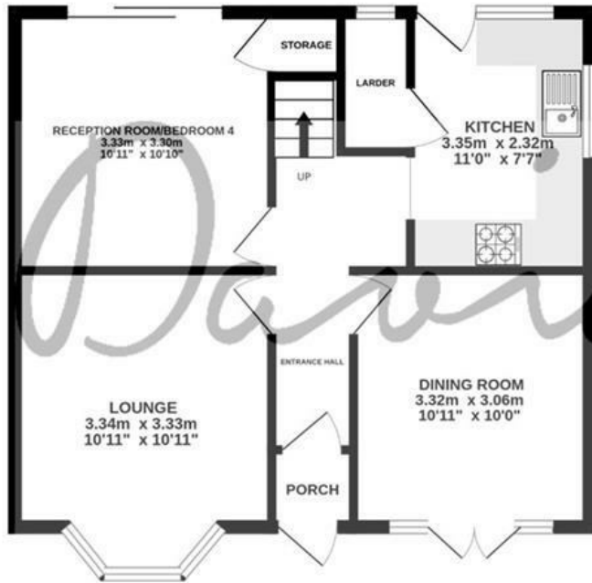
GROUND FLOOR 63.2 sq.m. (680 sq.ft.) approx.